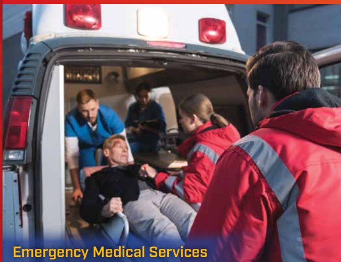
Emergency Medical Services