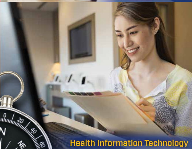
Health Information Technology