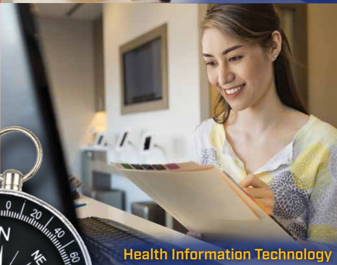
Health Information Technology